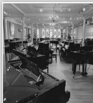
Visit our huge 1st floor piano showroom

Forsyth is the largest independent music store in the UK with an unrivalled selection of instruments, sheet music and musical gifts. Our historic Manchester City Centre store has been serving the North West's musicians since 1857. Come and visit our spectacular piano showroom and our recently refurbished rock, folk and orchestral instrument department one floor up. Whatever you play, we have the sheet music you need in our huge collection on the ground floor. And don't forget to play on our famous street piano outside!